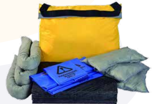
Maintenance Spill Kit Vinyl Holdall 50ltr - 50MHK