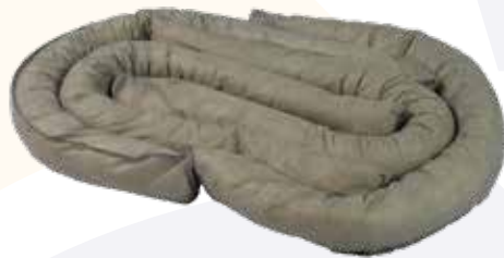
Maintenance Absorbent Socks pack of 20 - ESMS1 7.5cmØ x 1.2m - 5ltr per sock - 100ltr per pack