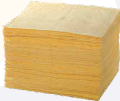
Chemical Absorbent Pads pack of 200 - ESCP2

40x50cm - 0.8ltr per pad - 80ltr per pack