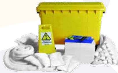
Oil Selective Spill Kit Yellow 4 Wheel PE Bin 600ltr 600O4WK