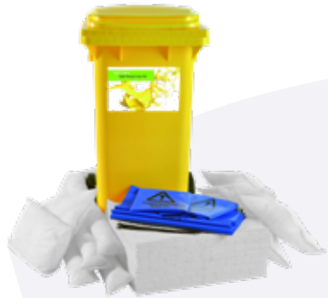
Oil Selective "Sustainable" Spill Kit Yellow 2 Wheel PE Bin 120ltr - 120OS2WK