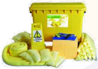
Chemical Spill Kit Yellow 4 Wheel PE Bin 600ltr 600C4WK