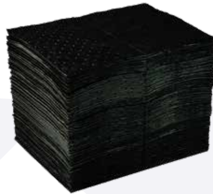
Maintenance Absorbent Pads pack of 100 - ESMP1 40x50cm - 0.8ltr per pad - 80ltr per pack

These versatile products can be used to respond to accidental spills or used pro-actively to line parts bins, contain leaks at the base of machinery, or catch drips from the underside of conveyor belts.