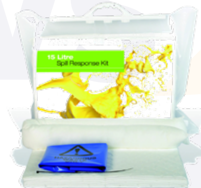
Oil Selective Spill Kit Clip Top Bag 15ltr - 15OBK

13cmØ x 3m - 30ltr per boom - 120ltr per pack