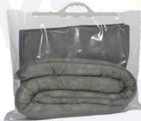
Maintenance Spill Kit Clip Top Bag 15ltr - 15MBK