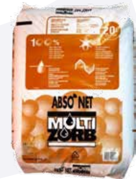
ABSO'NET Multi Zorb Granules

Convenient bags of absorbent granules for use on all types of spills. Simply pour the required amount of granules onto the spillage and wait for the granules to work before sweeping away.