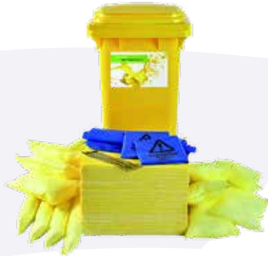
Chemical "Sustainable" Spill Kit Yellow 2 Wheel PE Bin 120ltr 120CS2WK