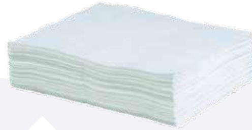
Oil Selective Absorbent Pads pack of 100 - ESOP1

Oil Selective spill kits are designed for use on spills of hydrocarbons (oil, fuel oil, petrol, diesel, vegetable oil etc.) both indoors and outside.