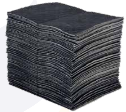
Maintenance Absorbent Pads pack of 200 - ESMP2 40x50cm - 0.6ltr per pad - 120ltr per pack