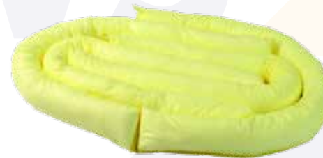
Chemical Absorbent Socks pack of 20 - ESCS1

40x50cm - 0.6ltr per pad - 120ltr per pack