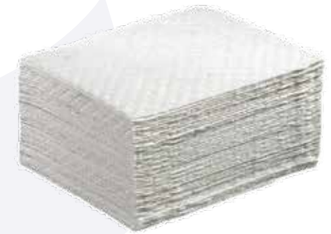
Oil Selective Absorbent Pads pack of 200 - ESOP2

40x50cm - 0.8ltr per pad - 80ltr per pack