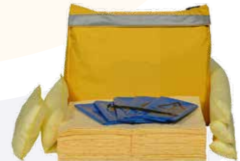
Chemical Spill Kit Yellow Vinyl Holdall 50ltr - 50CHK

7.5cmØ x 1.2m - 4ltr per sock - 80ltr per pack