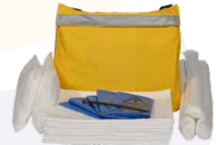
Oil Selective Spill Kit Yellow Vinyl Holdall 50ltr - 50OHK