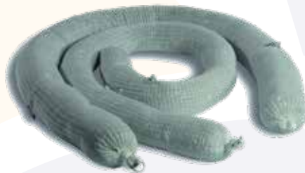
Oil Selective Absorbent Booms pack of 4 - ESOB13

40x50cm - 0.6ltr per pad - 120ltr per pack